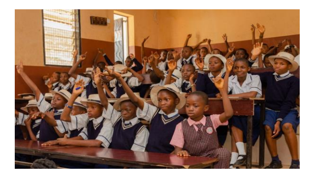
Plate 5: Quiz competition among the children participants.