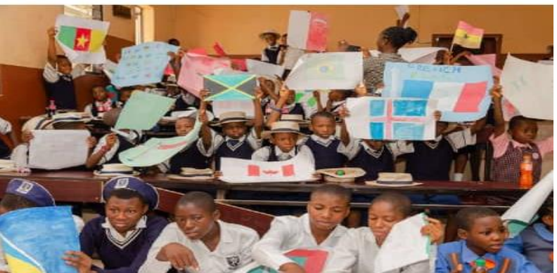
Plates 1&2: Flag Exhibtiion by children from selected schools in Ado-Ekiti, Ekiti State, Nigeria.